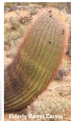
Elderly Barrel Cactus

Notice the "fishhooks" on these cacti. The O'odham people of southern Arizona used them to catch fish. They're tough and very sharp.