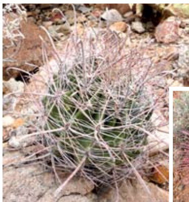
Baby Fishhook Barrel Cactus, 8" across.