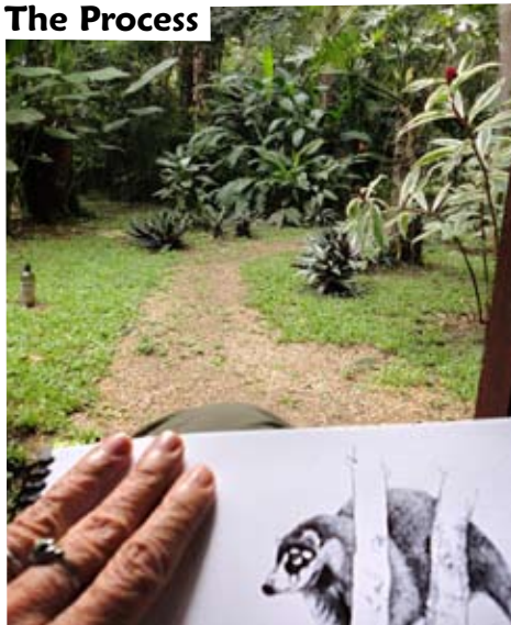
Drawing in the open doorway of my cabana.

Photographing Tallulah, the coati mundi, was no easy task. She moved so swiftly she left only a blur on most of my photos. This sketch, one of my favorites in this journal, was drawn from two photos that didn't blur, shown above. The right photo was used mostly to help with the tail.