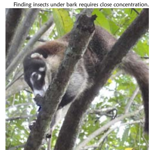
Finding insects under bark requires close concentration.