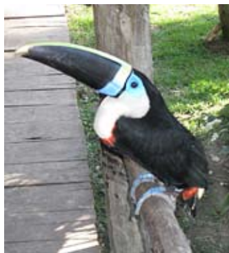
Tio Juan, the Yellow-ridged Toucan

Okay, this is kind of an embarrassing page. If you compare the photo of Tio Juan, the toucan, below, with my sketch of him above, you will notice a slight (I wish!) difference. This sketch bothered me